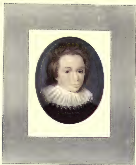
A SON OF SIR KENELM DIGBY BY ISAAC OLIVER (1632)